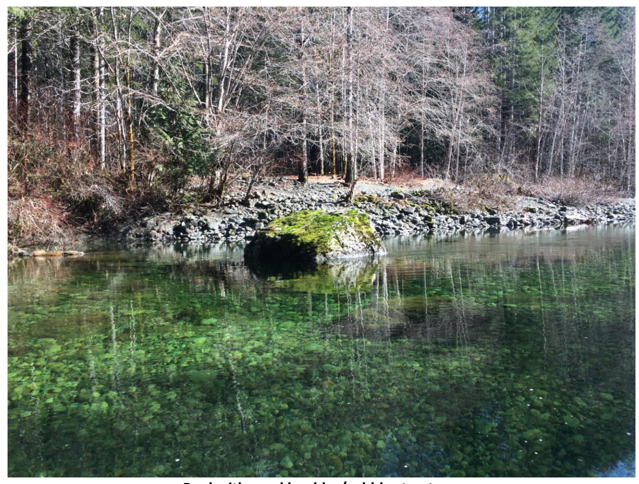
Pool with good boulder/cobble structure

and long, deep glides with structure (where's the shallow water Leo)