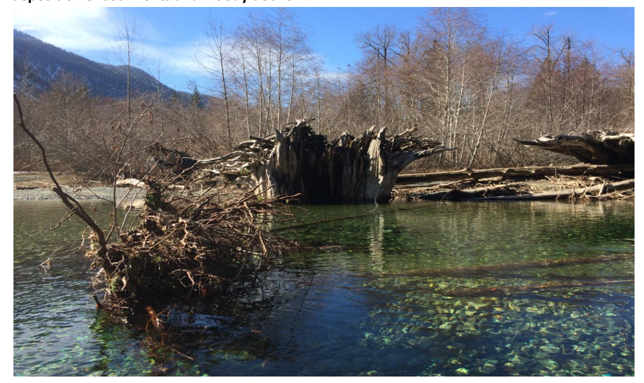
...and closer to Sproat Lake the Taylor widens and shallows even more with greater deposition of sediments and woody debris