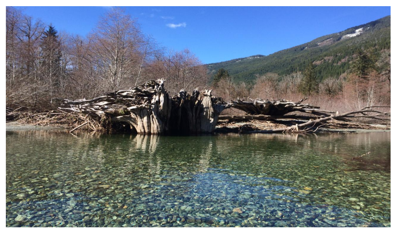
Buried up-side down