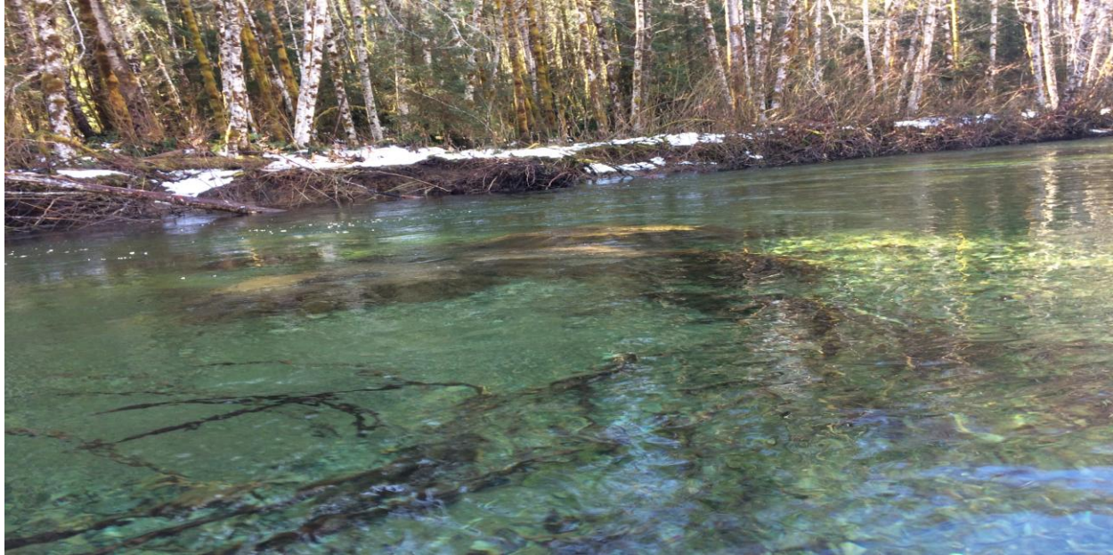
Three Old Logging Stumps mid river