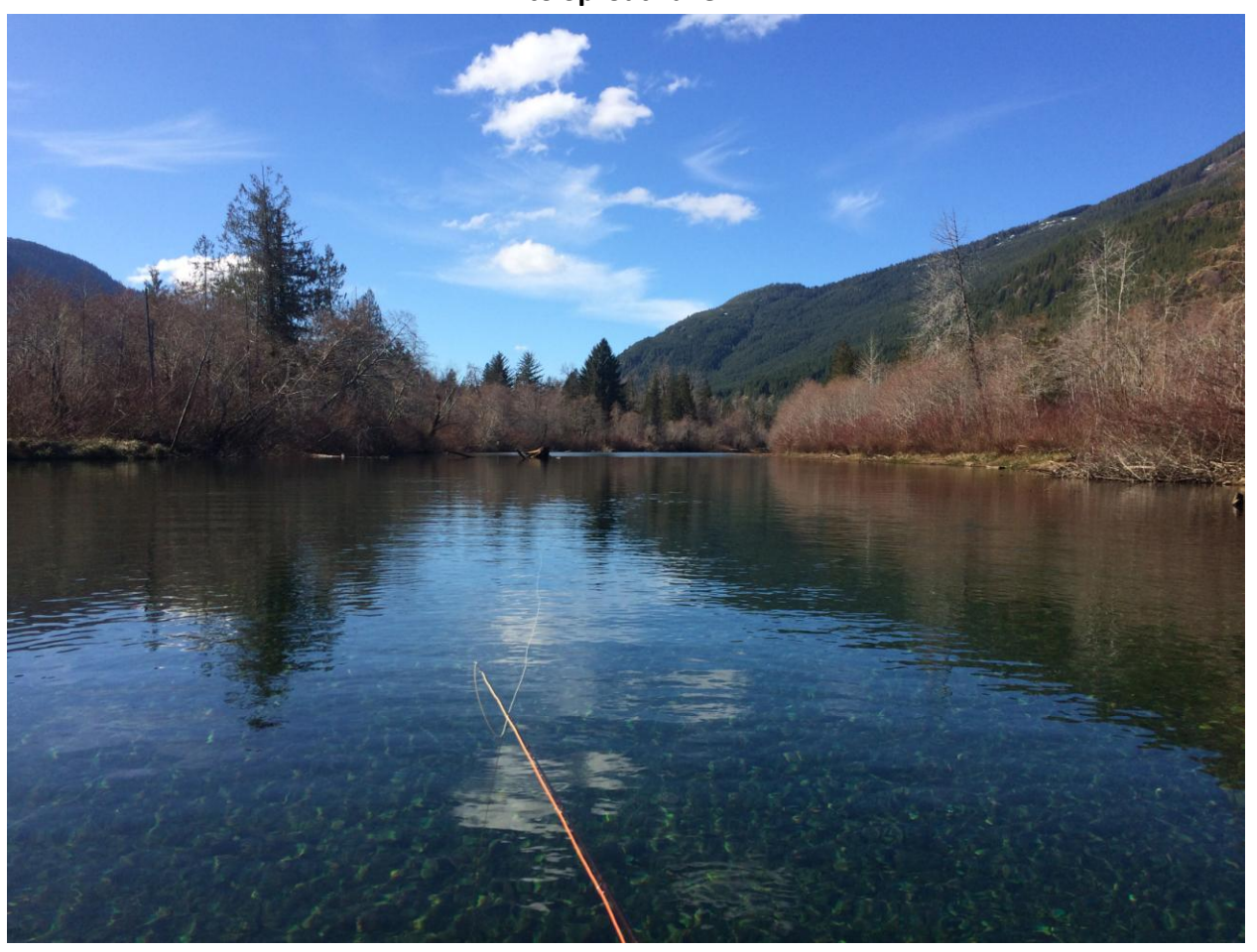
Looking upstream in the Taylor River from near Sproat Lake

After a portage or two the water in all the minor sub channels joined and it was clear sailing to Sproat Lake