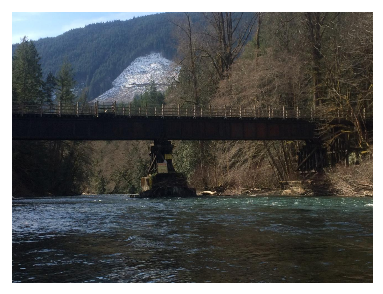
70.2 mile Trestle

and Cabin Pool was occupied by a guide boat and we had better "secret spots" further downstream to fish.